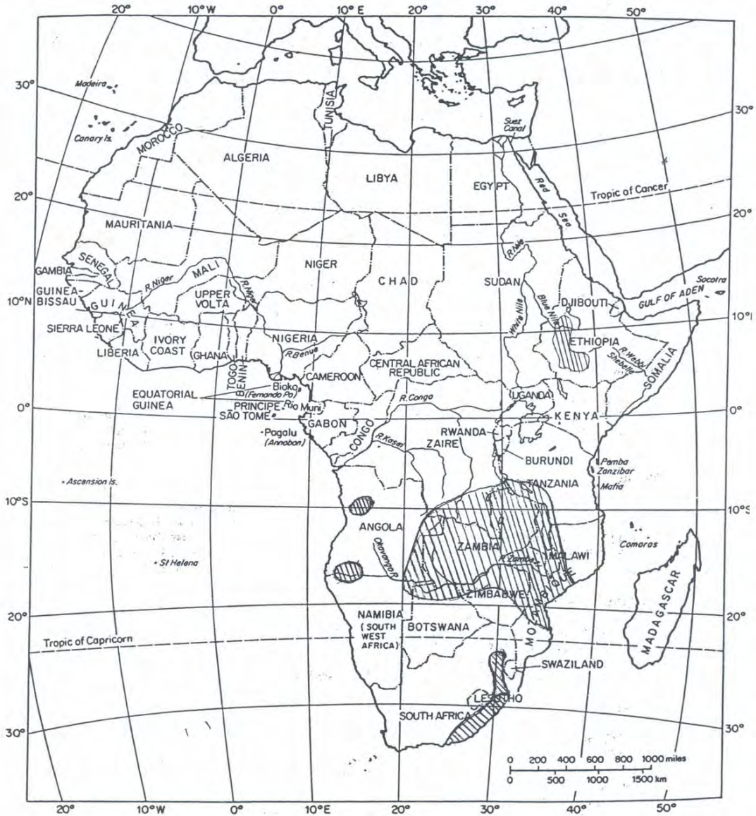
Map from The Birds of Africa Volume I, Academic Press Inc. (London) Ltd., New York, 1982; page 25, modified by F. Beall.